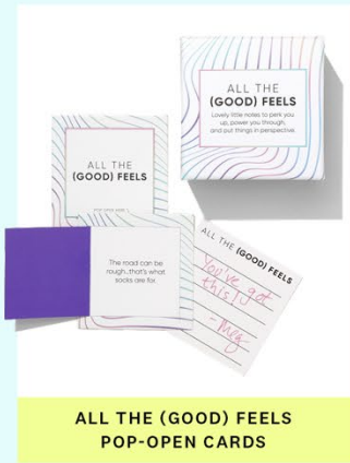
ALL THE (GOOD) FEELS POP-OPEN CARDS