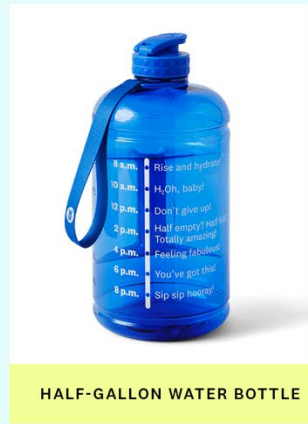
HALF-GALLON WATER BOTTLE